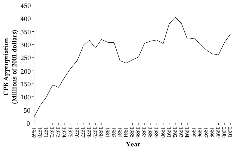
Figure 2. Corporation for Public Broadcasting Appropriations